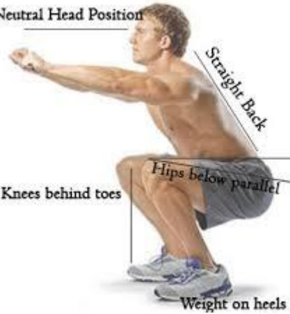
Neutral Head Position