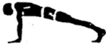
STARTING POSITION (UP)

Here are a few Core exercises for you to do at home.